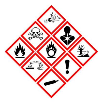
Online training (before week 3)