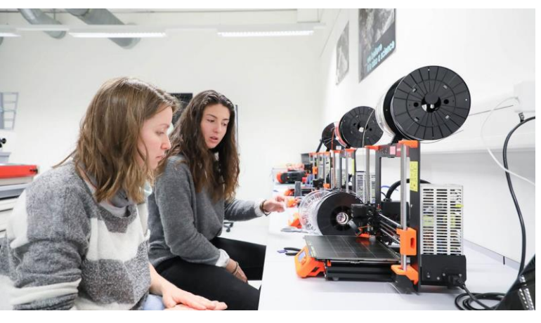
3D printing training (week 9, 25.4)